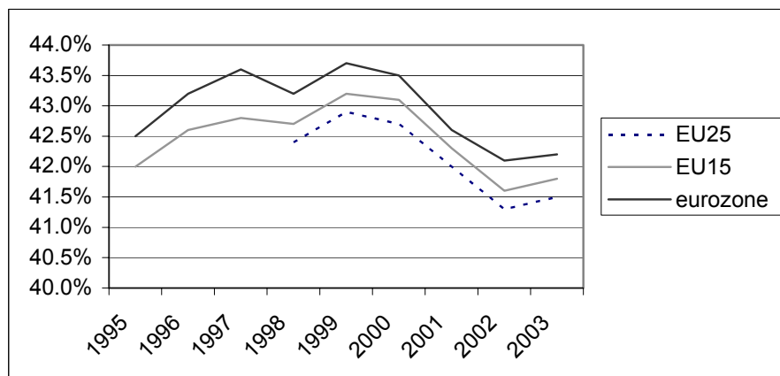
Figure 1: Tax revenue in the EU25, EU15 and euro-zone (% of GDP)

Tax revenue paid to the EU institutions decreased both in the euro-zone and in EU15 from 0.6% of GDP in 1999 to 0.4% in 2002. This figure remains unchanged at 0.4% of GDP in 2003.