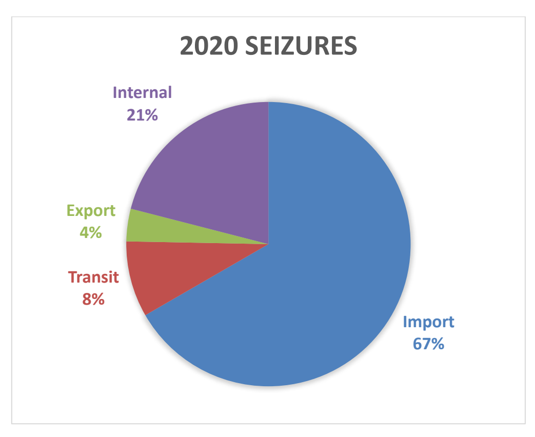
Figure 1 - Proportion of seizures of illegally traded wildlife by direction of trade<sup>22</sup>

The EU plays many roles in the international wildlife trade. It is an important market for wildlife and their products globally. As shown in Figure 1, it is also a transit and source region for wildlife traded both legally and illegally.