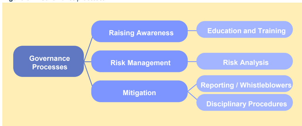
Figure 3.2: Governance processes

The Committee will manage the identification of risks and mitigation measures. These will include those risks that concern core values, international partnerships and security (both infrastructure and cybersecurity). However, these risk studies should only be carried out when the countries involved do pose a potential hazard (see also Chapter 2 and 4 for details). The details of foreign interference for these are detailed in the relevant sections of this document. The Committee will oversee measures to raise awareness of potential threats from foreign interference among staff and students. This will be achieved through education and training as the proactive participation of staff and students will be a core component of identifying risks. This importance of awareness raising and training has already been stressed in the previous chapter on Values. The Committee will provide guidance and oversee measures to ensure smart management of intellectual assets and compliance with intellectual property rules in international cooperations. The FI Committee will also be responsible for investigating cases of potential foreign interference. This may require external expert input especially when dealing with cases of institutional foreign interference. In instances it may be necessary to impose disciplinary procedures, but the focus will be identifying and avoiding potential foreign interference. When assessing risk, it is important that FI Committee safeguards academic freedom.