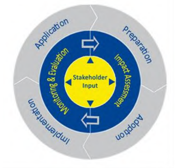
Figure 1. The EU policymaking cycle

‘Better regulation’ covers the whole policy cycle (see Figure 1), from policy design and preparation, through adoption, implementation (transposition, complementary non-regulatory action) and application (including monitoring and enforcement) to evaluation and revision. For each phase, there are relevant ‘better regulation’ principles, objectives, tools and procedures to make sure that the EU develops sound, evidence-informed policies. The following sections cover the main instruments of ‘better regulation’.