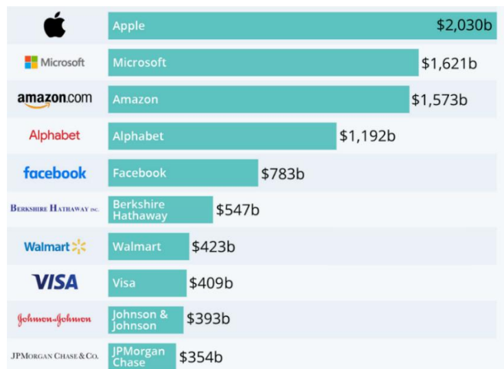
Figure 3 – Market capitalisation of largest companies included in the S&P 500 index, Nov 2020