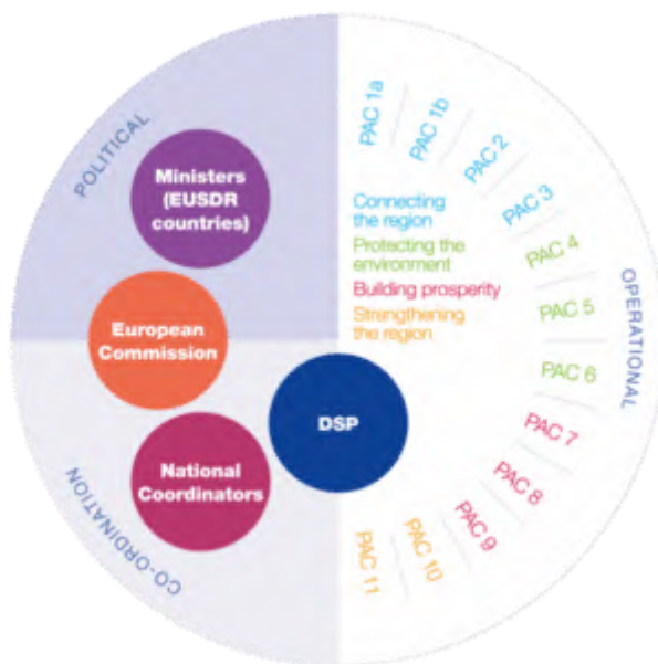
Picture 1: The governance of the EUSDR

c) The revision process started in May 2018. The main steps and the timeline are set out in Annex 1 . The EUSDR Communication (COM 2010a) remains untouched. This means that the principles laid down in the Communication remain entirely valid , including the EUSDR governance and the structure with four Pillars and twelve Priority Areas (see pictures 1 and 2). Still, the Action Plan is considered as a "rolling document", which means that the Danube countries should remain attentive if there is a need for adaption.