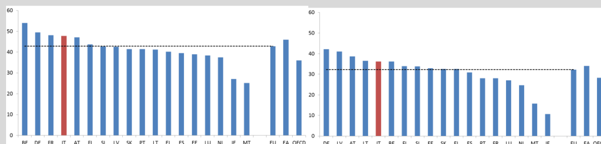
The tax burden on labour in Italy at the average wage and at low wage (2016)

Notes: No recent data is available for Cyprus. EU and EA averages are GDP-weighted. The OECD average is not weighted. Source: European Commission Tax and Benefit Indicator database based on OECD data.