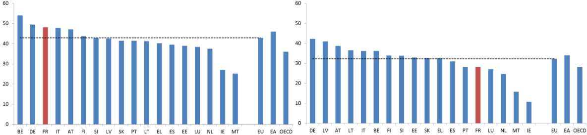
The tax burden on labour in France at the average wage and at low wage (2016)

Notes: No recent data is available for Cyprus. EU and EA averages are GDP-weighted. The OECD average is not weighted.