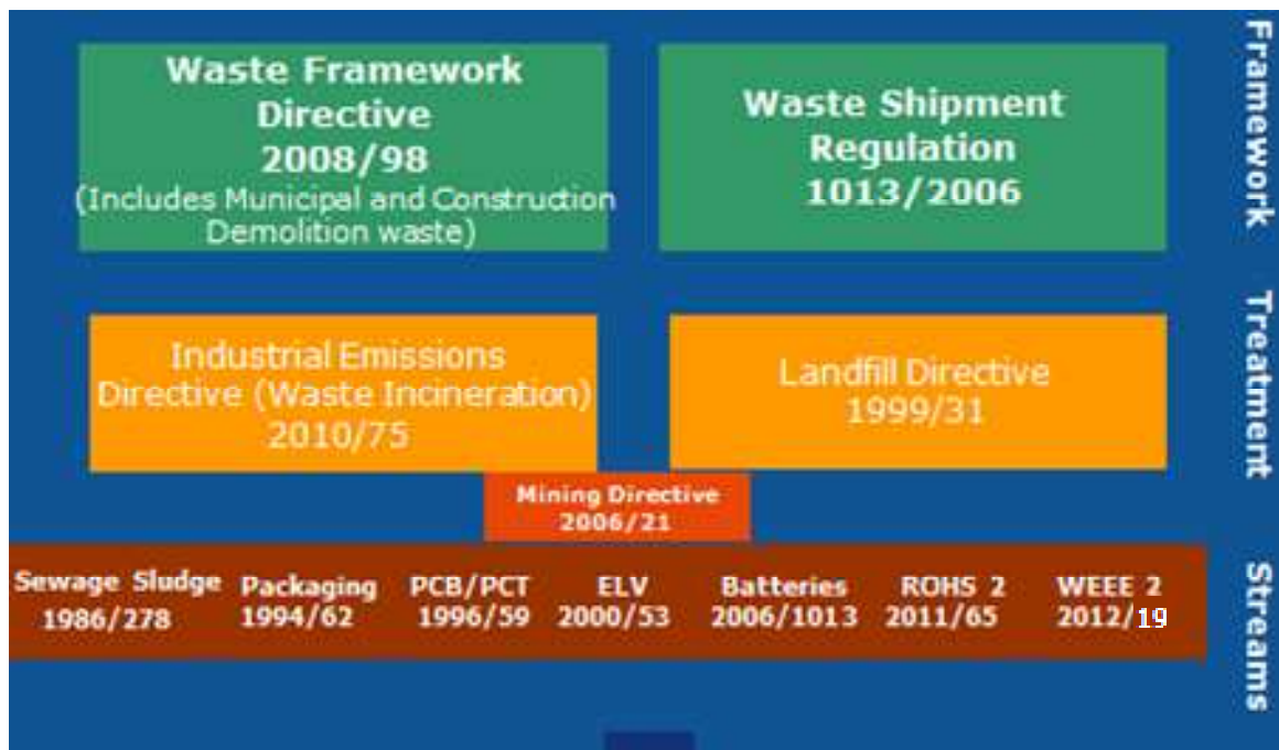
101 Table 1: Overview of EU waste legislation