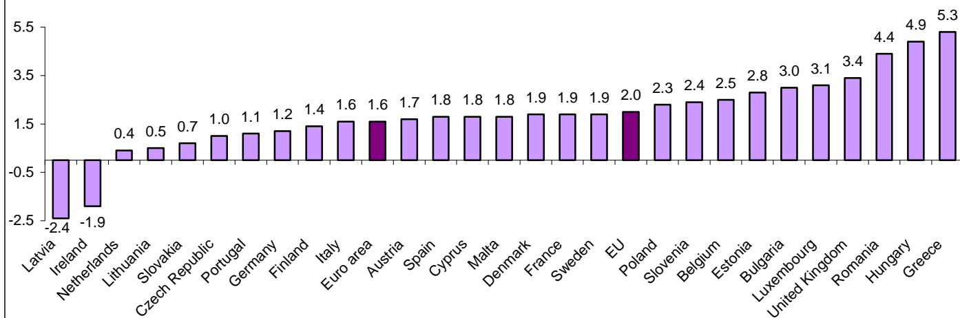
Figure 2: Annual inflation rates (in %), May 2010*

* Data for Netherlands and Austria are provisional.