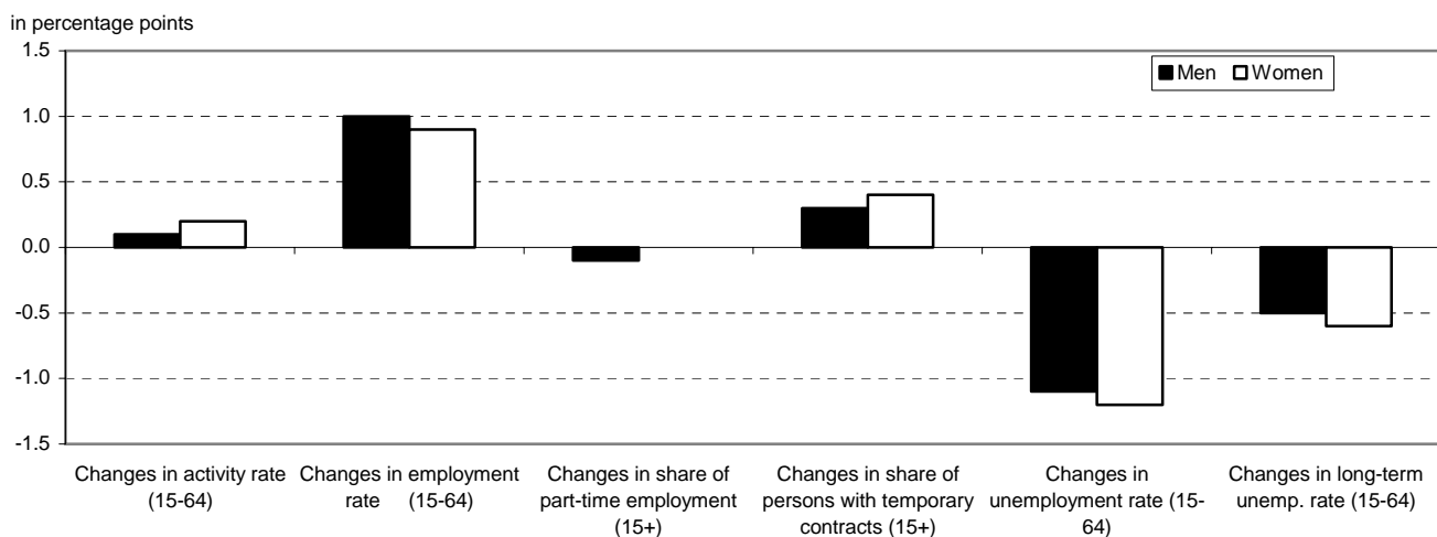
Chart 2: Labour market indicators change for EU-27 from 2006Q1 to 2007Q1

1 Number of people in employment aged 15 to 64 years divided by the total resident population aged 15 to 64 years.