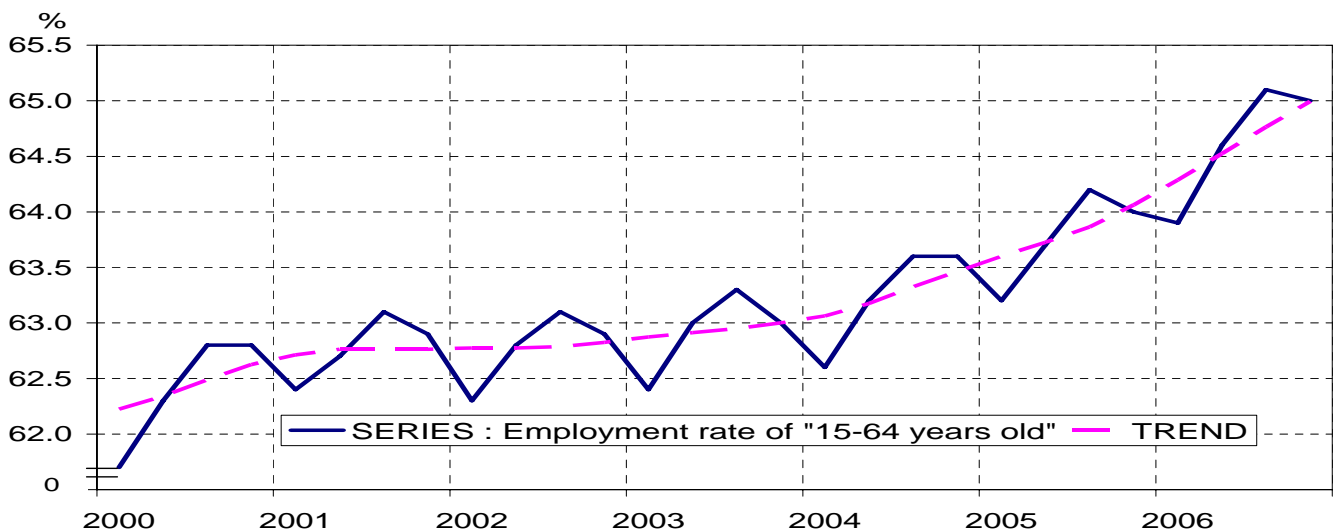
Chart 1: Employment rate 1 (15-64 years) for EU-25 from 2000Q1 to 2006Q4

This publication belongs to a quarterly series presenting the main results of the EU Labour Force Survey for the EU-25 and for all Member States.