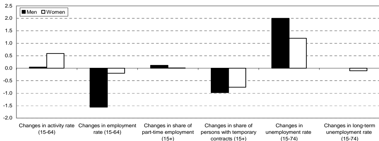
Chart 2. Changes in selected indicators for EU-27 from 2008Q1 to 2009Q1, percentage points