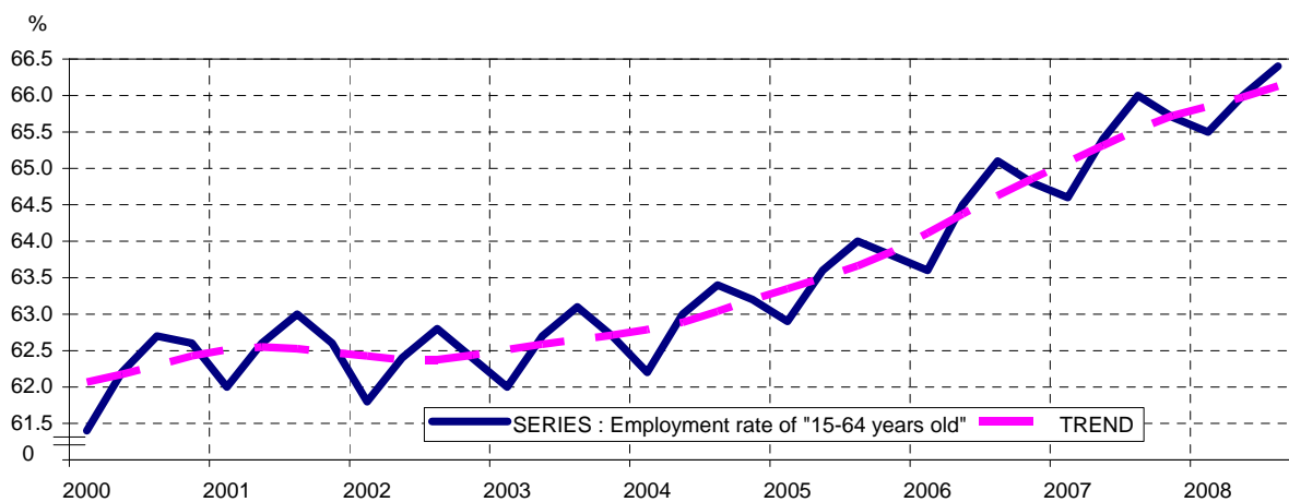
Chart 1. Employment rate 2 (15-64 years) for EU-27 from 2000Q1 to 2008Q3