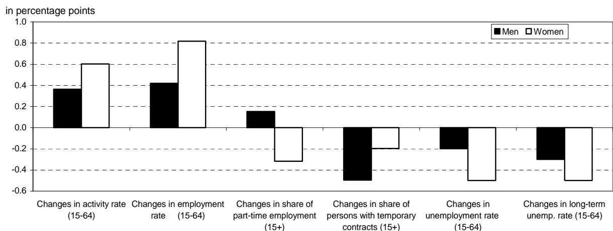
Chart 2: Changes in selected indicators for EU-27 from 2007Q2 to 2008Q2