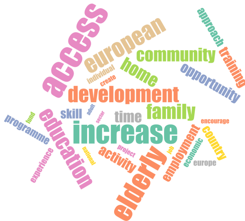
Image 1: Result of text mining of all the responses to the green paper public consultation – 30 most frequent words

This chapter presents some general observations, followed by more detailed observations on the responses to the questions set out in the green paper, grouped under the six thematic clusters listed in the introduction. Results include feedback on the roadmap, discussions at meetings and webinars and the input to the public consultation. Sections 4.1.-4.7. summarise stakeholders' general views, suggestions and recommendations, and give a few selected examples. Where relevant, contrasting views of stakeholder groups are highlighted. Section 4.8. presents stakeholders' recommendations on the role of the EU in the different policy areas.