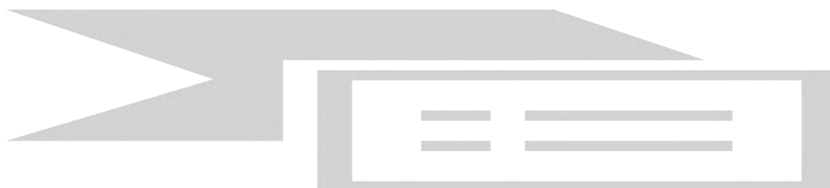
Table 3: Provisioning of the EFSI GF for the period 2015-2022 (EUR million)

The Guarantee Fund is provisioned progressively up to the target amount of EUR 9 100 million by 2022.