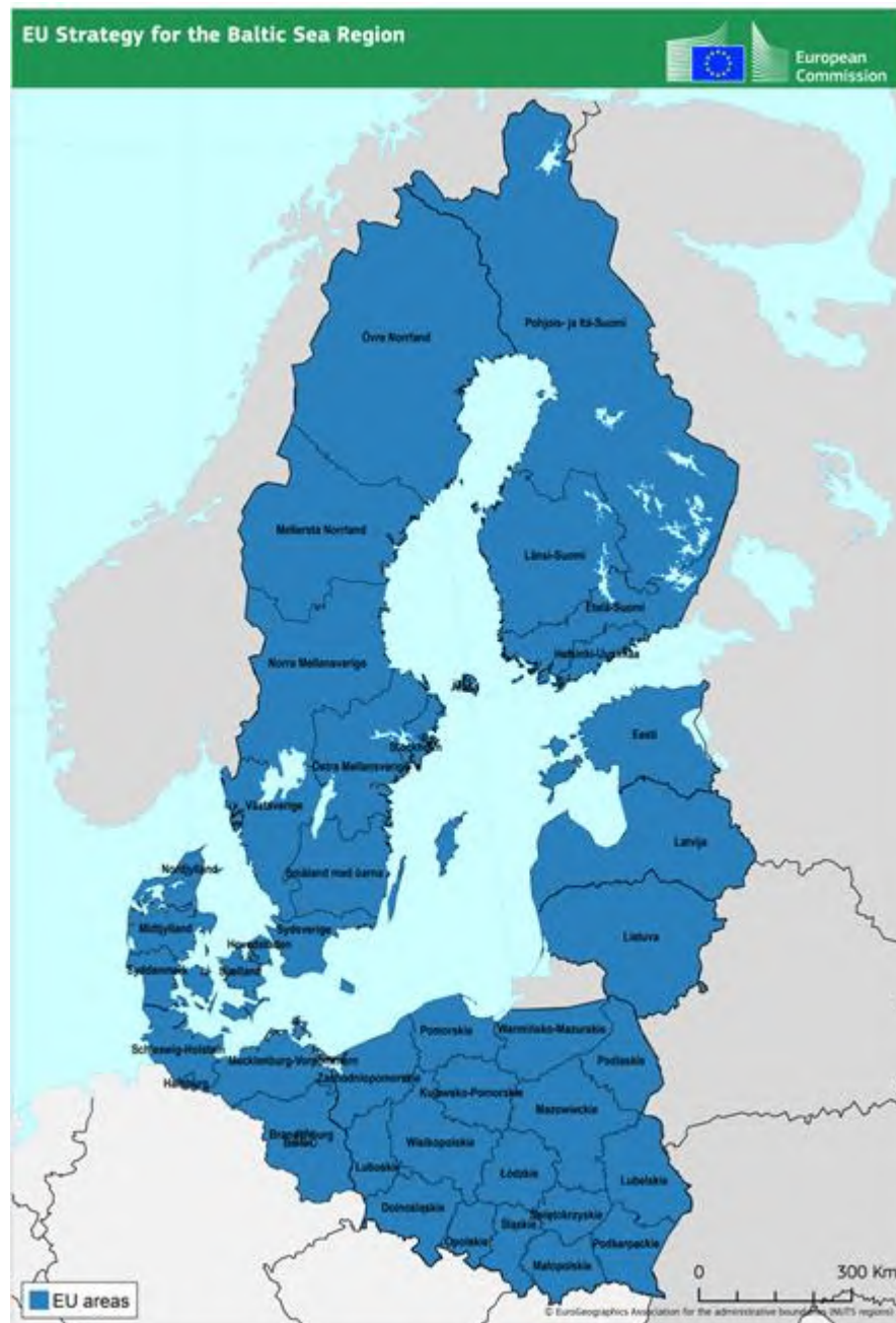
Annex 1: map of the EU Strategy for the Baltic Sea Region