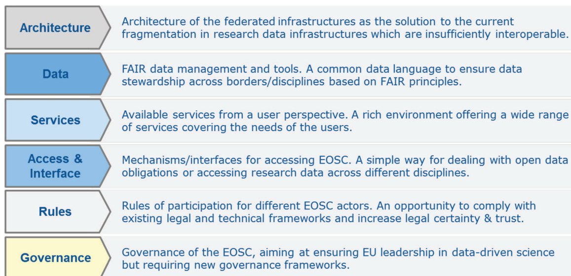
Figure 1 – EOSC Model action lines

The model describes a pan-European federation of data infrastructures built around a federating core and providing access to a wide range of publicly funded services supplied at national, regional and institutional levels, and to complementary commercial services. The model includes six actions lines: (a) architecture, (b) data, (c) services, (d) access and interfaces, (e) rules and (f) governance (Figure 1, below).