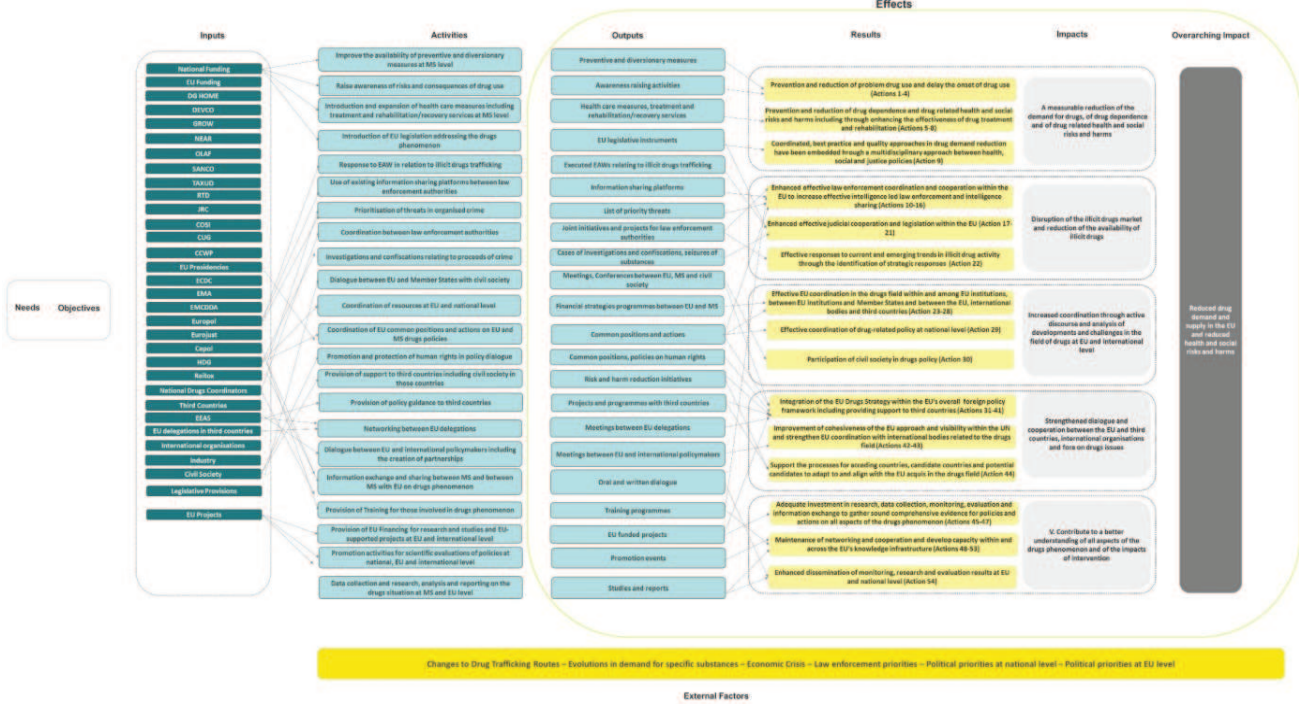
Figure 1 Intervention logic 11

The graphic representation below illustrates the intervention logic of the EU Drugs Strategy, summarising in a schematic way how its different elements were expected to interact.