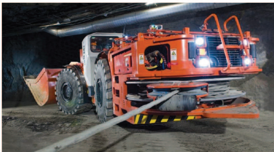
Figure 3: Example of NRMM without on-board power source: a wheel loader used in mining

The current NRMM definition would thus lead, after 22 July 2019, to a situation resulting in very similar types of equipment being regulated differently and inconsistently.